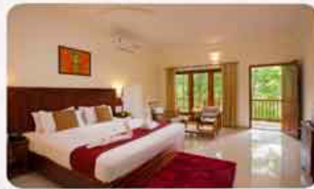
Coffee Bean Club House