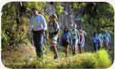
Nature Walk and Green Walk