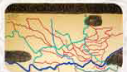
Tourist Route Map