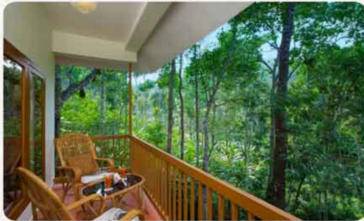
Coffee Bean Club House