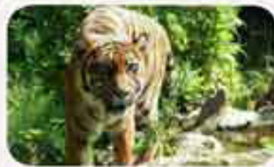
The Periyar Tiger Reserve