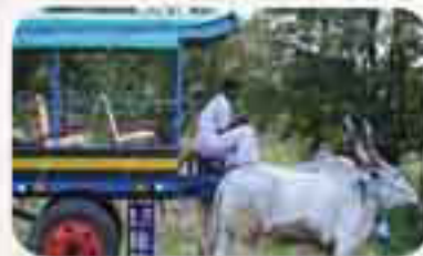
Bullock Cart Discoveries