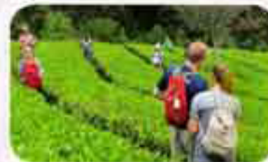
Organic Village Visit