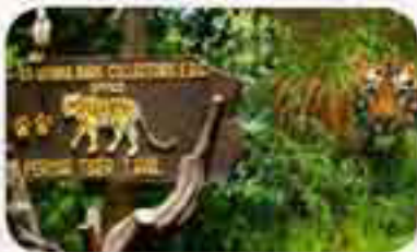
Periyar Tiger Trail